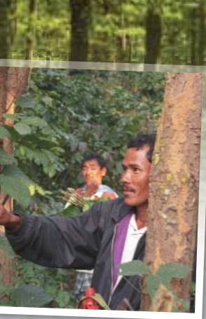
...they work together raising vouna trees, improvina auality, predicting vields, and harvesting products...