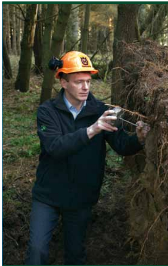
LEFT A scientist from the Forestry Commission's Northern Research Station in Midlothian, Scotland, takes soil measurements from the root plate of a windblown Sitka spruce tree.