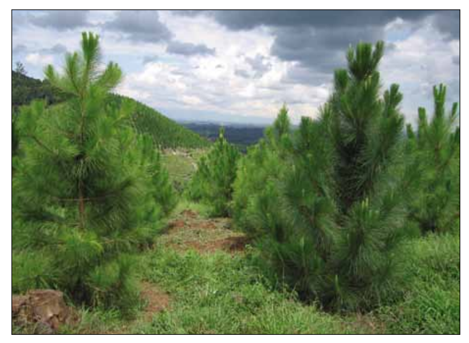
Pine plantation establishment, Tanzania, 2008

for a strategic framework to enable the Bank to play an effective role in the protection, conservation, management, and sustainable use of forests in its regional member countries.