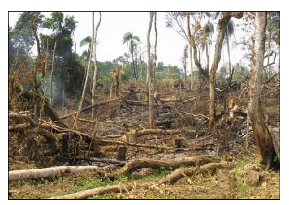
Destroying the forest for agricultural purposes, Uganda 2007

priorities, the forestry sector is often assigned low priority compared to food security, health, education, and other sectors. As a consequence, insufficient budgetary allocations are provided to the sector. Many African countries, in their day-to-day struggle to satisfy the most basic needs of their populations, are unable to take a long-term view, which is the time-frame, required for the successful implementation of sustainable forestry management programmes.